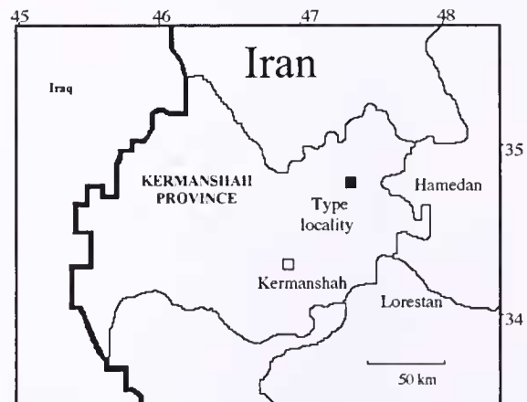
Figure 2. The type locality of Eremias (Eremias) montanus , vicinity of the Village of Siah-Darreh, about 60km northeast of the city of Kermanshah, Kermanshah Province, western Iran.

The lacertid genus Eremias Fitzinger, 1834 encompasses about 33 species of mostly sand, steppe, and desert dweller lizards which are distributed from northern China, Mongolia, Korea, Central and southwest Asia to southeastern Europe (Rastegar-Pouyani and Nilson, 1997). The genus is Central Asian in its relationships and affinities (Szczerbak, 1974). About 15 species of the genus Eremias occur on the Iranian Plateau mostly in northern, central, and eastern regions (Rastegar-Pouyani and Nilson, 1997; Anderson, 1999). To date, no comprehensive study has been carried out on Eremias fauna of the Iranian Plateau and the systematic status of most taxa is in great need of a revisionary work. Szczerbak (1974), however,